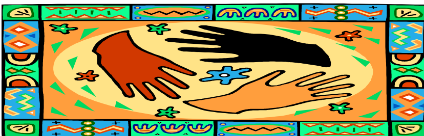
PARTNERS: WORKING HAND IN HAND

(4) Carson City State Library (on Stewart) has an ESL special section if you have a library card. Check it out for supplemental teaching materials.